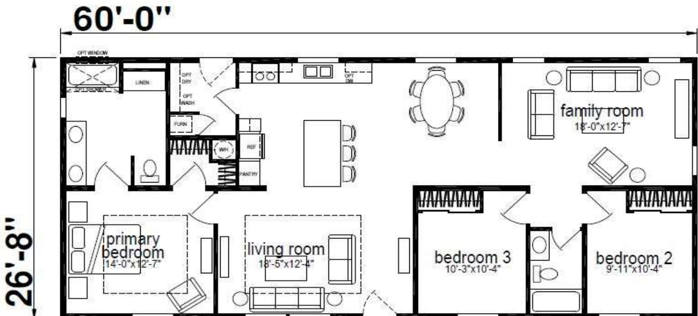
G816/6028 (1,600 SQ. FT.) 3BEDROOM - 2BATHS

Due to continued improvements and material change, specifications may change without notice. Room sizes are approximate.